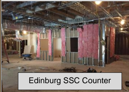
Edinburg SSC Counter