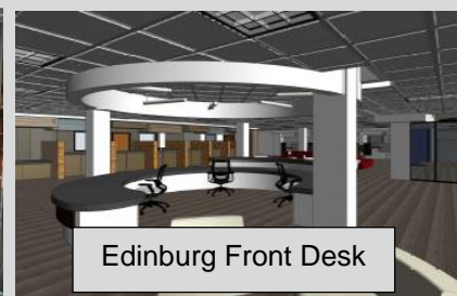
Edinburg Front Desk