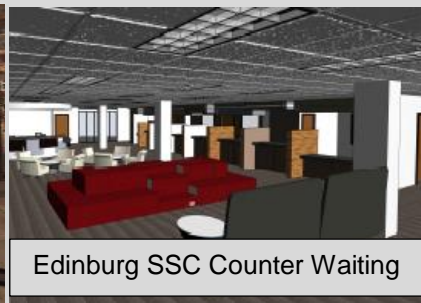
Edinburg SSC Counter Waiting