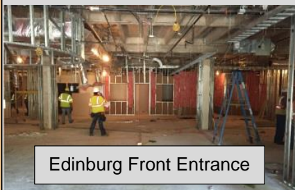
Edinburg Front Entrance